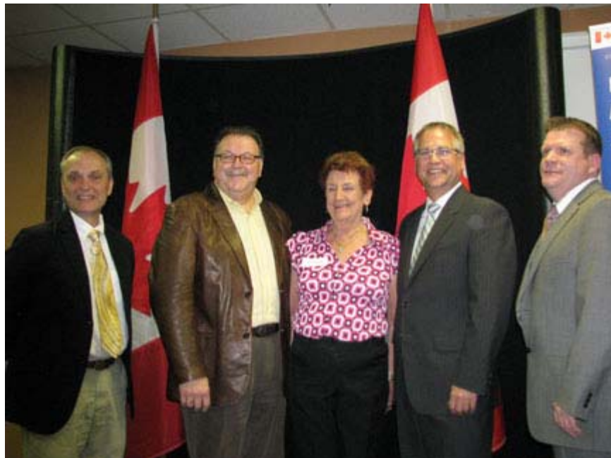
SOS Program Gets Federal Funding

The Honourable Gary Goodyear Minister of State Science & Technology and member of parliament for Cambridge today announced federal support to Lang's Farm Village Association under the Government of Canada's New Horizons for Seniors Program.